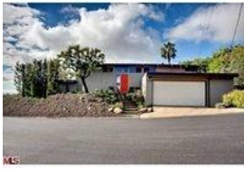
NEW TO MARKET

Eames Chair Manufacturer's Mid-Century in Crestwood Hills